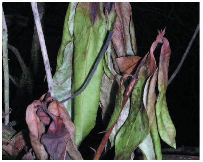
Rhododendron shoot dieback and leaf necrosis

The majority of findings have been on Rhododendron ponticum and rhododendron hybrids. Early leaf symptoms include a blackening of the leaf petiole that often extends into the base of the leaf. This necrotic (dead and dying) lesion may progress further into the leaf tissue and in extreme cases affect the whole leaf. Occasionally, however, only blackening of the leaf tip is observed. Both old and young leaves appear to be affected equally and, unusually for a Phytophthora infection of rhododendron, leaves often fall within a few weeks of infection. Shoot dieback and cankers frequently occur and where these girdle the stem tissue, the leaves above the lesion wilt. In severe infections, the whole bush may be killed. Leaf and stem infections can be found at any height or position on a rhododendron bush.