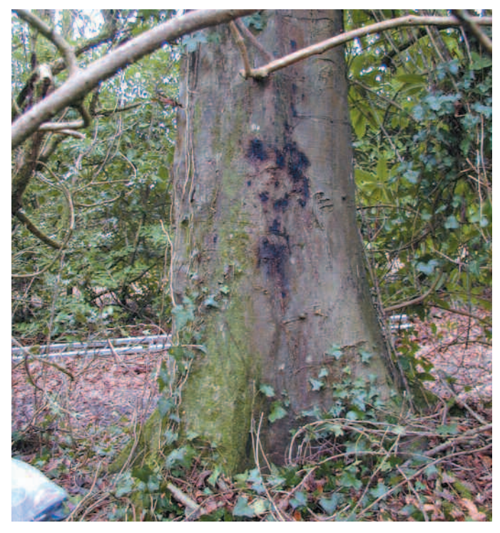
Canker on the trunk of a mature beech tree, next to an infected rhododendron

Since it was first seen in October 2003, there have been further findings in a small number of woodlands and gardens in Cornwall and south Wales. It has been found on a single nursery in Cheshire from which it has now been eradicated.