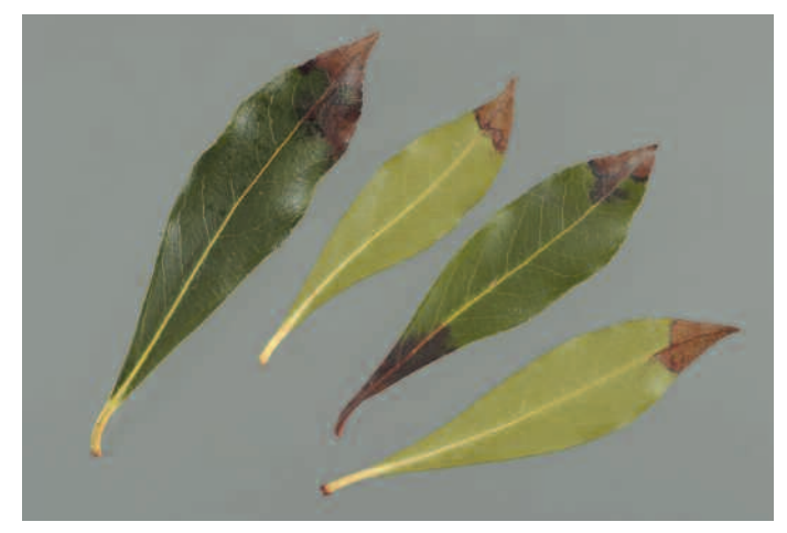
Pieris spp. leaf necrosis

Similar leaf blight symptoms to rhododendron are seen, but with no obvious dieback or cankers. Infection on Michelia doltsopa is characterised by necrotic leaf lesions on the leaves that progress along the leaf margins and into the tissue of the leaf blade. Necrotic leaf tissue is characteristically a dark black-brown colour. Typically lesions on leaves of Pieris species are a light tan to rusty brown colour. Necrosis progresses directly towards the central (midrib) vein, and along the vein, causing a visually striking leaf blight.