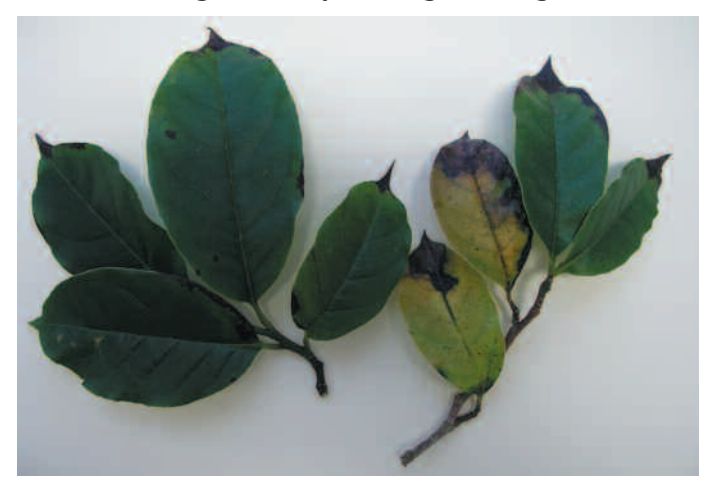
Michelia doltsopa leaf necrosis