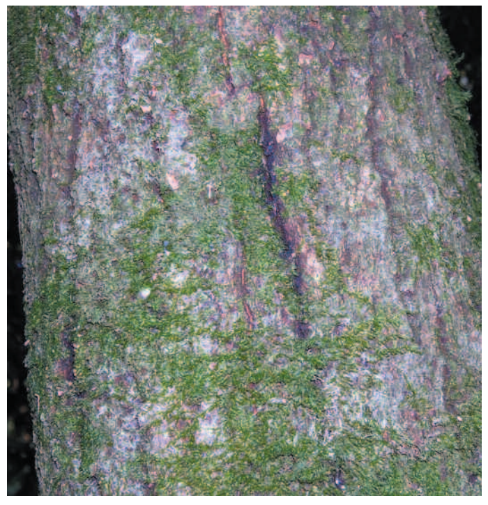
Bleeding lesion on English oak ( Q. robur )

Bleeding lesions on the trunk are similar to those on F. sylvatica but may be more difficult to see both internally and externally because of the thick outer bark ridges and outer bark plates of oak. Bleeding can occur from cracks between the bark ridges. Older cankers may not become sunken as with beech.