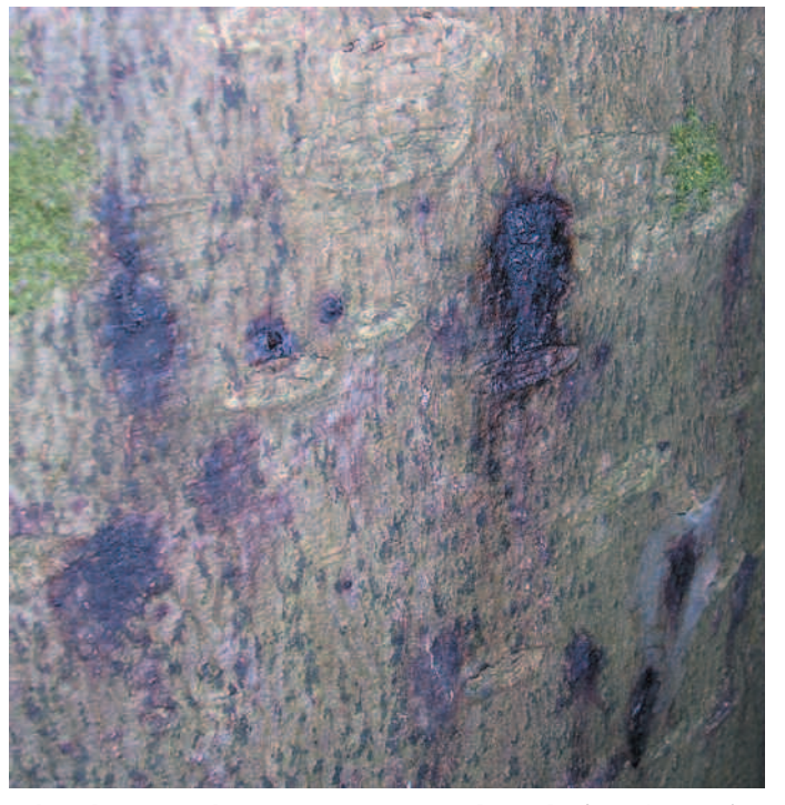
Bleeding canker on European beech (F. sylvatica)