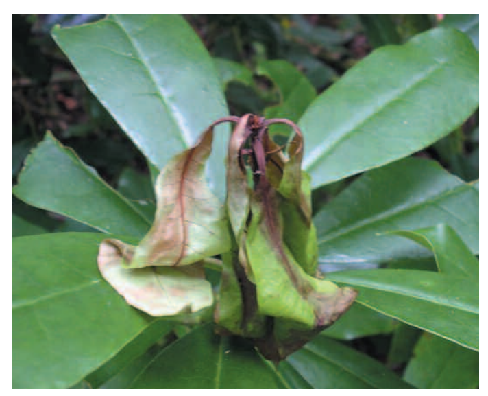
Rhododendron terminal shoot wilt (note blackening of midrib and leaf tip)

Similar leaf blight symptoms to rhododendron are seen, but with no obvious dieback or cankers. Infection on Michelia doltsopa is characterised by necrotic leaf lesions on the leaves that progress along the leaf margins and into the tissue of the leaf blade. Necrotic leaf tissue is characteristically a dark black-brown colour. Typically lesions on leaves of Pieris species are a light tan to rusty brown colour. Necrosis progresses directly towards the central (midrib) vein, and along the vein, causing a visually striking leaf blight.